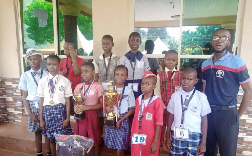
Elementary School Spelling Bee