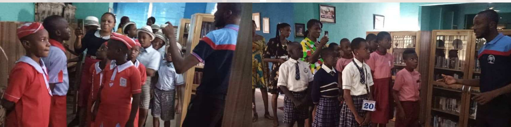
Library Tours for Spelling Bee Students