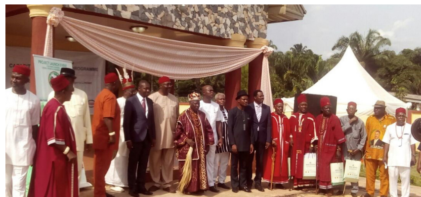
Community Leaders on SOWL Grounds