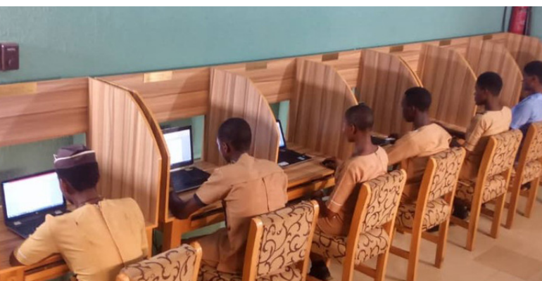
Muldowney Computer Room