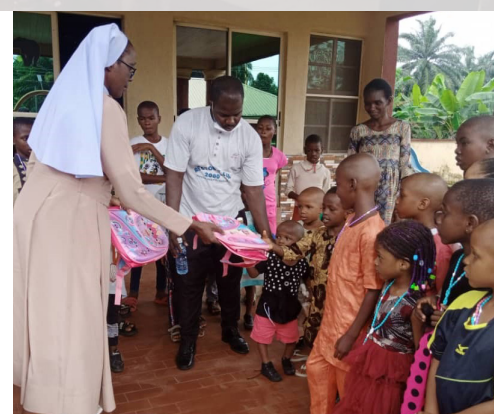
Back to School Party, Receiving Supplies