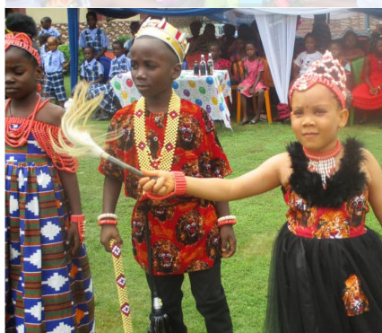
SOWA Kids in Traditional African Costumes