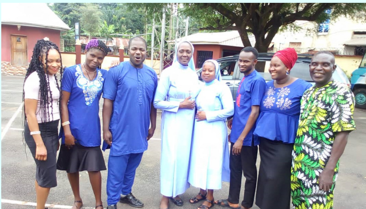
Seat of Wisdom Academy