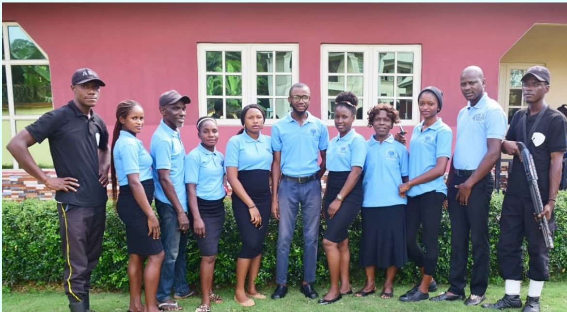
Seat of Wisdom Library