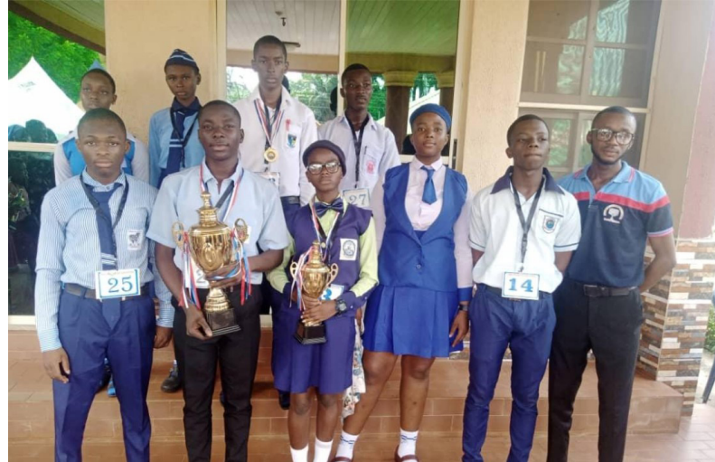
Secondary School Spelling Bee