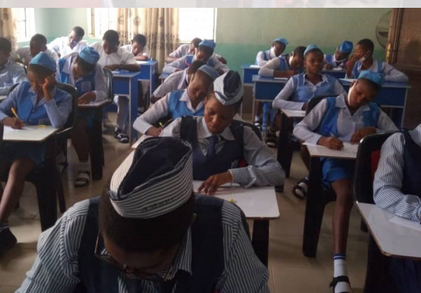
Dumoulin Children Room