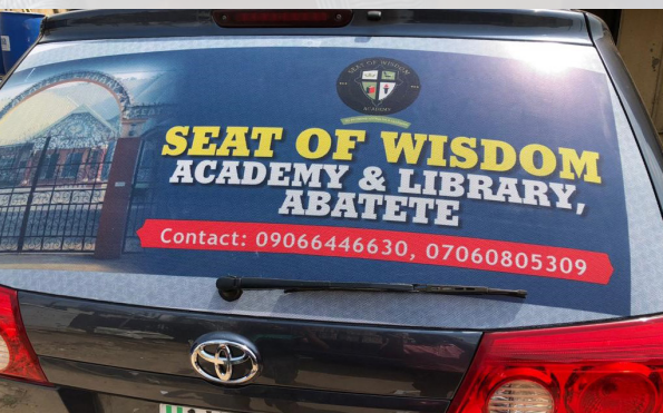
New Library and School Van