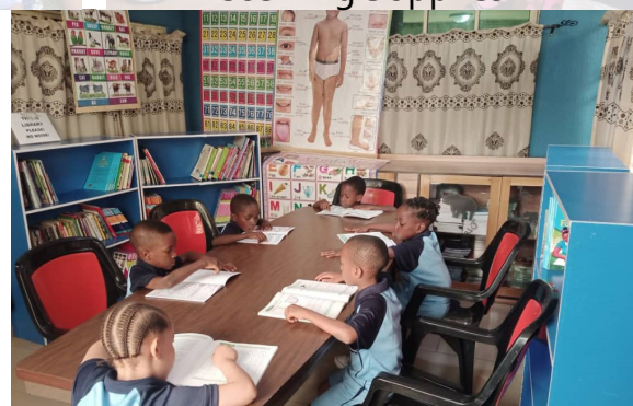
New Kids Section