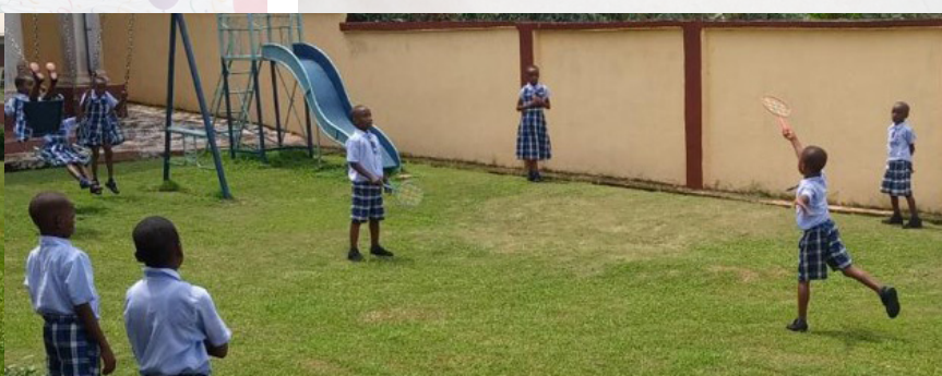
Fun Outdoor Play Time for Students