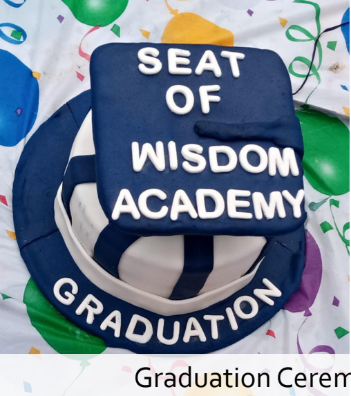
Graduation Ceremony at the Academy